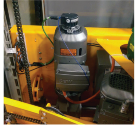
Model 25H encoder mounted on a motor

Electrical noise typically enters a system as one of two types: radiated and conducted. Radiated noise propagates through the air, while conducted noise finds an electrical path onto the encoder cables from ground loops, power supplies, or other equipment connected to the system.