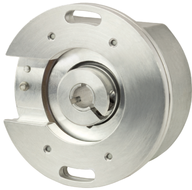
Ø2.1" Patent #6,608,300B2