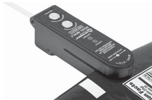
Light Mark on a Dark Web (Figure B)