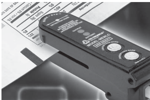
Dark Mark on a Light Web (Figure A)