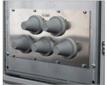
Cable routing through the divider panel of a Rittal TS 8 baying enclosure system via module plates.