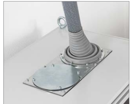
Routing of a rigid supply line through a closed enclosure roof via module plates. Cut-out size 314 x 144 mm.