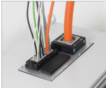
Routing of several cables with and without connectors through a closed enclosure roof via module plates. Cut-out size 314 x 144 mm.