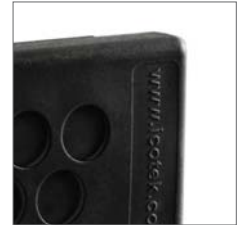
Also available in black.