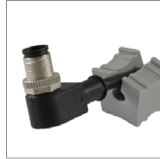
Slit KT grommets