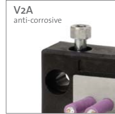
Also available with stainless steel screws (V2A).