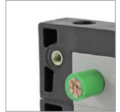
Also available with threaded bushings.