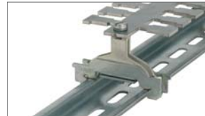
Type SK: Mounted on screw-foot for DIN-rail shape H