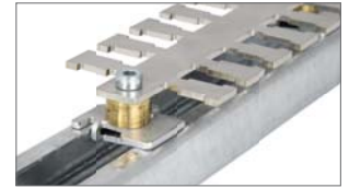
Type SC: Mounted on screw-foot for DIN-rail shape C