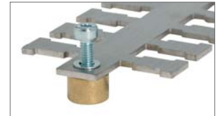
Type DH: Mounted on bushing for flexible fixation on bottom sheet