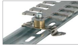
Type SF: Mounted on snap foot for DIN-rail shape H